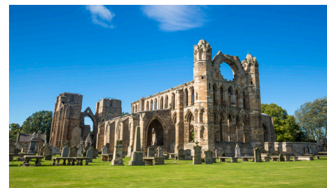
Elgin Cathedral

Day 5 - Today will be at leisure in the granite city of Aberdeen . Aberdeen is a unique city, known for its grey stone architecture, golden sandy beach and vast dunes, as where two rivers meet the sea. It's also a city with two historic Old Towns. Old Aberdeen is home to cobbled streets, mature trees and 15th century fortified cathedral. Footdee (known locally as Fittie) is a quirky