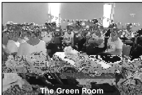
The Green Room

Invited to perform at the Maghull Methodist Church Spring Fete our girls shone as one of the star attractions. Well done!