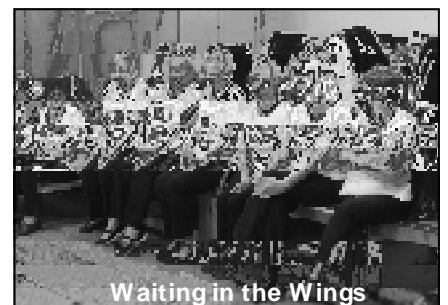
Waiting in the Wings

Deadline for items for our July Newsletter is the 15th of June. Available on the 27th of June